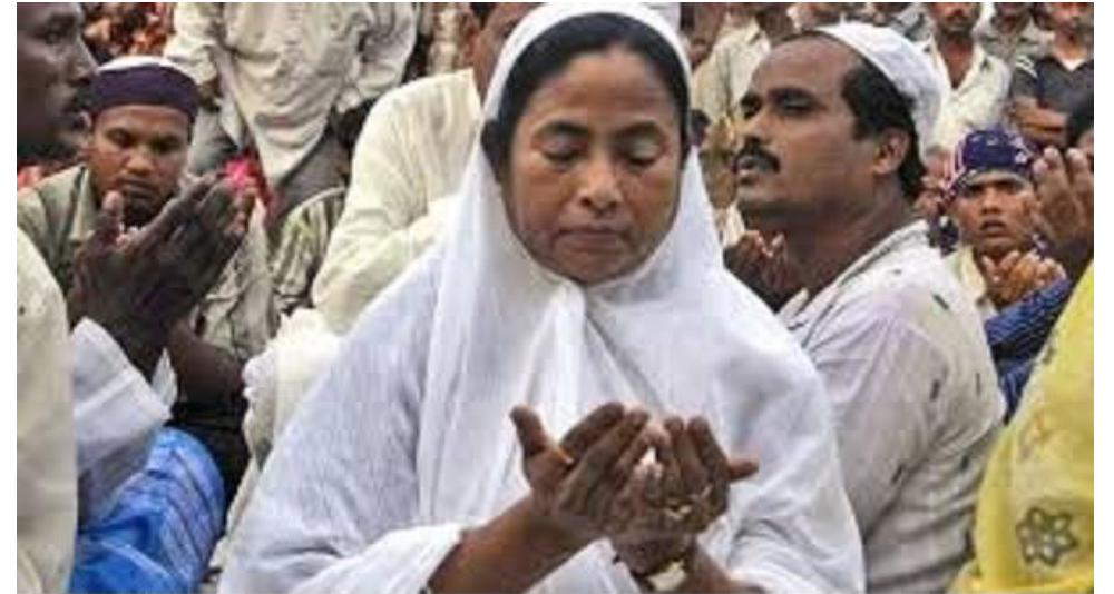
Chief Minister Mamata Banerjee with Muslim leaders in Malda. Her policies of appeasement has been criticized for stoking fundamentalism. A communal riot broke out in Malda in January but her government has refused to say the strife was due to religious tensions.